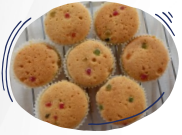
Delicious Cup Cake