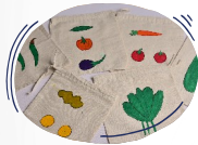
Fridge Cotton Vegetable Bags