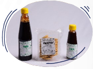
Tamarind Sauce & Bisucits